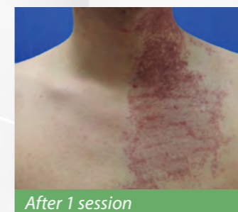
After 1 session